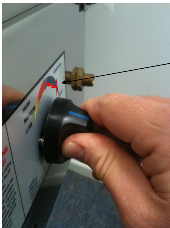
2.5mm gap when compressed